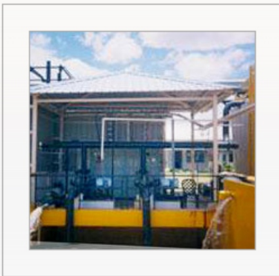
Effluent Treatment Plant

RevOs Aqua offers wide range of waste water treatment plants applicable to textile mills, slaughter houses, diaries, paper mills, oil refineries, cold rolling mills, glass factories, chemical and processing industries etc.