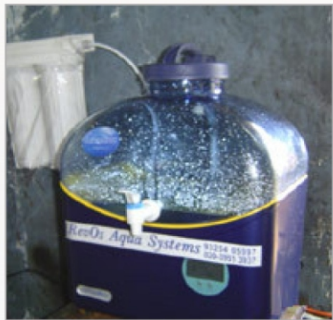
Domestic Reverse Osmosis Units

Reverse Osmosis, also known as hyper filtration, is the finest filtration known. This process will allow the removal of particles as small as ions from a solution. Reverse osmosis is used to purify water and remove salts and other impurities in order to improve the color, taste or properties of the fluid.