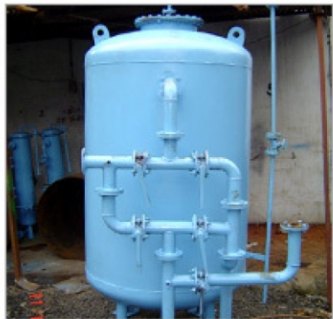
Iron, Manganese & Arsenic Removal Filter