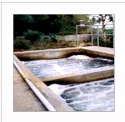
Sewage Treatment Plant