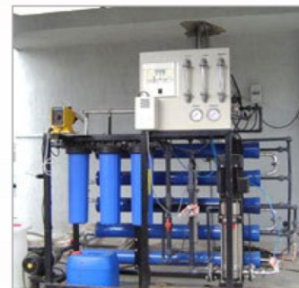
Skid Mounted Industrial Reverse Osmosis Plants