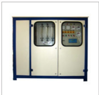
Industrial Reverse Osmosis Plants