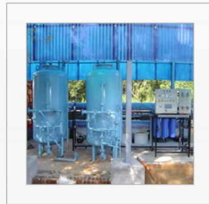
Tertiary Treatment For Effluent Treatment Plant