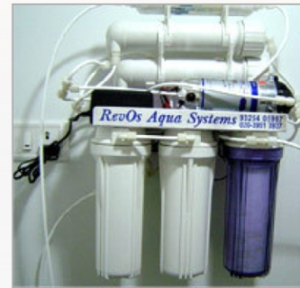
Institutional Reverse Osmosis Systems